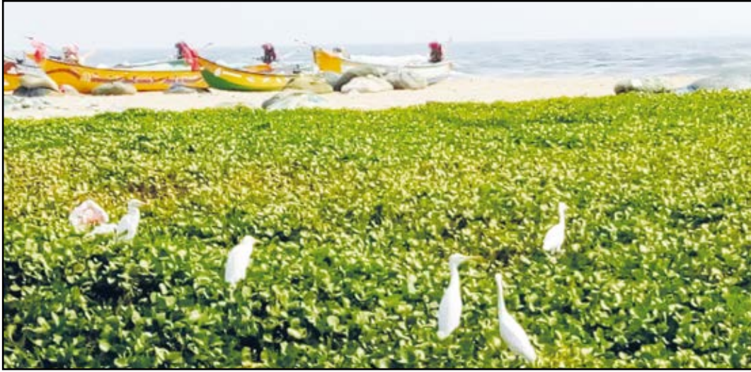
On a recent morning, a bunch of cranes were spotted in the scrubland off the Marina Loop Road in Foreshore Estate beachside. They were feeding on the remnants of fish that the local fisherwomen had thrown here. Locals said the cranes are seen here often. - Caption by Juliana Sridhar